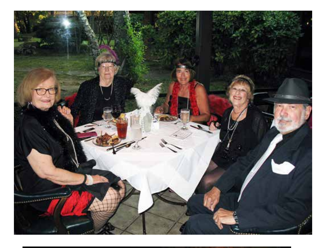
The gang from Fairfield Bay on the left wanted to dine!

It looks like Maxine is ready to do the charleston? Kick high girl!