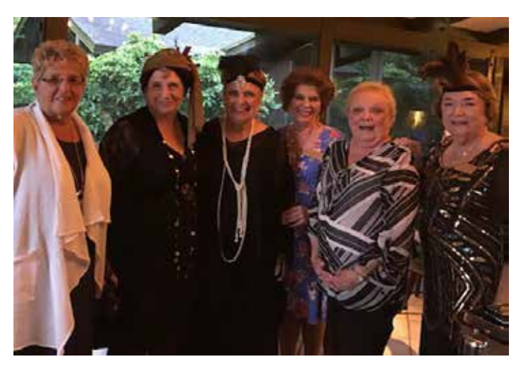
VAPOR VALLEY QUESTERS Chapter 1307