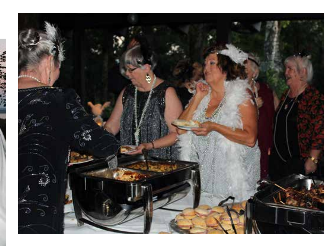
Then the food came!